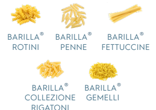
BARILLA® ROTINI BARILLA® PENNE BARILLA® FETTUCCINE BARILLA® COLLEZIONE RIGATONI BARILLA® GEMELLI

© 2020 Barilla G. e R. Frielli - Società per Azioni. All Rights Reserved