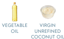
VEGETABLE OIL VIRGIN UNREFINED COCONUT OIL