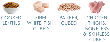
COOKED LENTILS FIRM WHITE FISH, CUBED PANEER, CUBED CHICKEN THIGHS, BONELESS & SKINLESS, CUBED